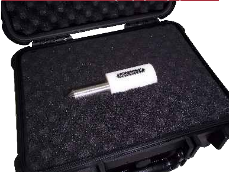
Test Probe 1 y 2